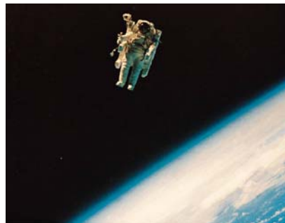
Planning leads to wonderful destinations

Planning Team in applying the findings to the planning process